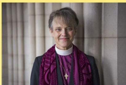
Bishop Mariann Edgar Budde